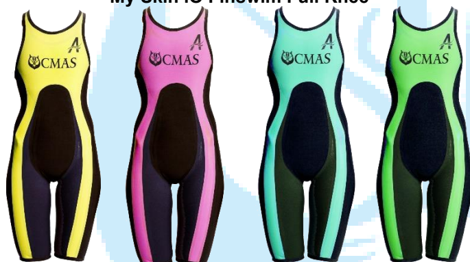
My Skin iO Finswim Full Knee