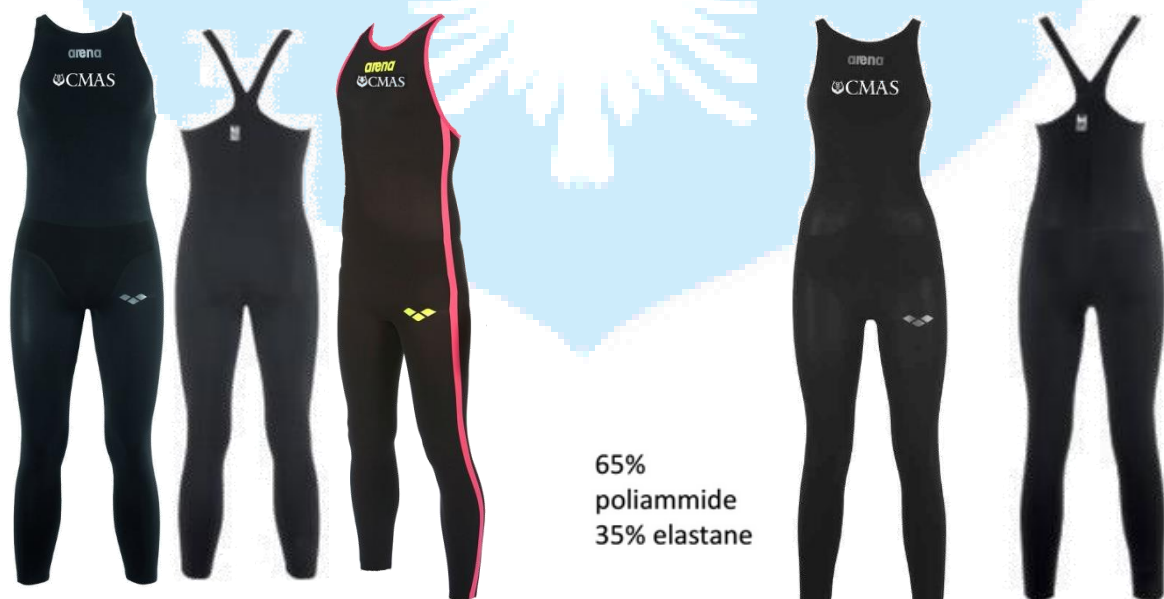
Evo + for Man